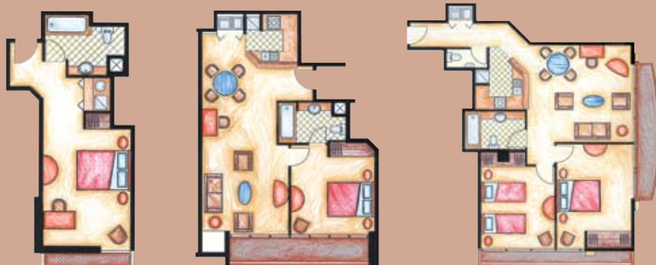
STUDIO APARTMENT - 30.60m 2 ONE BEDROOM APARTMENT - 66m 2 TWO BEDROOM APARTMENT - 88.20m 2